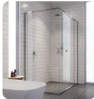
STEGBAR GRANGE SEMI FRAMELESS SHOWERSCREENS