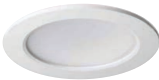
LED DOWNLIGHTS THROUGHOUT