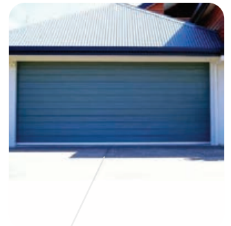
STEELINE GARAGE SECTIONAL GARAGE DOOR