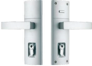
GAINSBOROUGH ANGULAR TRILOCK