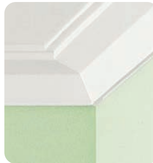
PROFILED CORNICE THROUGH THE ENTRY AND LIVING AREAS