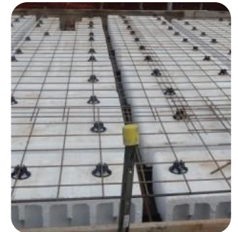
H CLASS WAFFLE POD SLAB