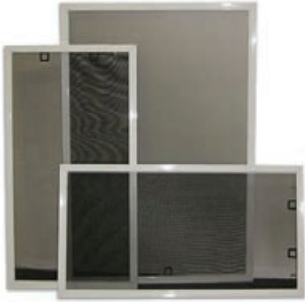
POWDER COATED FLYSCREENS TO ALL OPENING WINDOWS