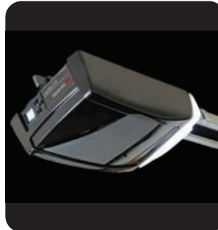
AUTOMATIC GARAGE DOOR OPENING UNIT TO ONE GARAGE