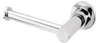
GEN X ACCESSORIES