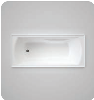
STYLUS 1675MM MAXTON BATH