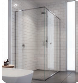
STEGBAR GRANGE SEMI FRAMELESS SHOWER SCREENS