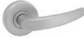
GAINSBOROUGH OUTLINE SERIES INTERNAL DOOR FURNITURE