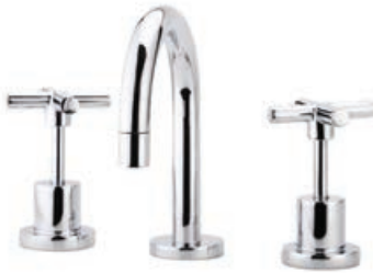
POSH SOLUS TAPWARE