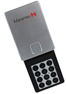
KEYLESS OPERATION TO GARAGE