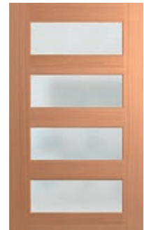
HUME XS24 1200 TRANSLUCENT GLASS