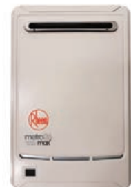
RHEEM METRO 26 INSTANTANEOUS HOT WATER UNIT