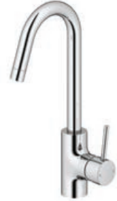
MIZU DRIFT KITCHEN MIXER