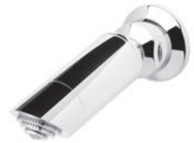
GEN X SHOWER ROSE