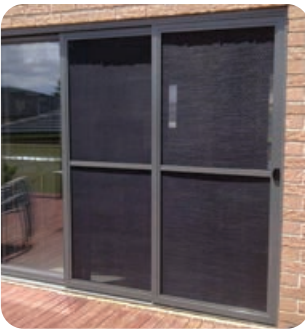
POWDER COATED ALUMINIUM SLIDING FLYDOORS TO SLIDING DOORS