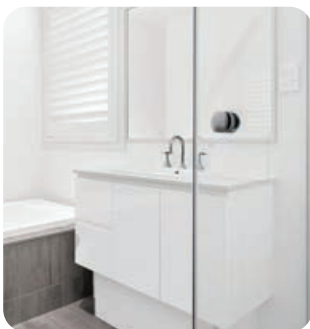
DURAPLEX VANITY INCLUDING 20MM FLAT WHITE STONE TOPS